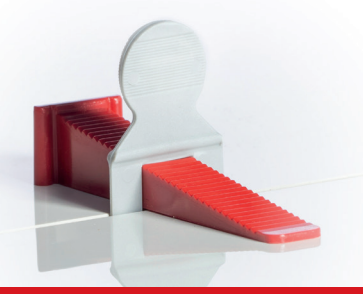
HIGHER PRECISION of work regardless of the tile size and